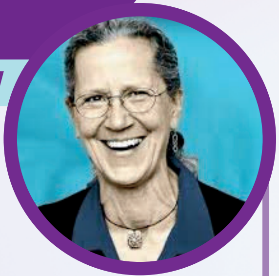
Founder of Positive Approach to Care