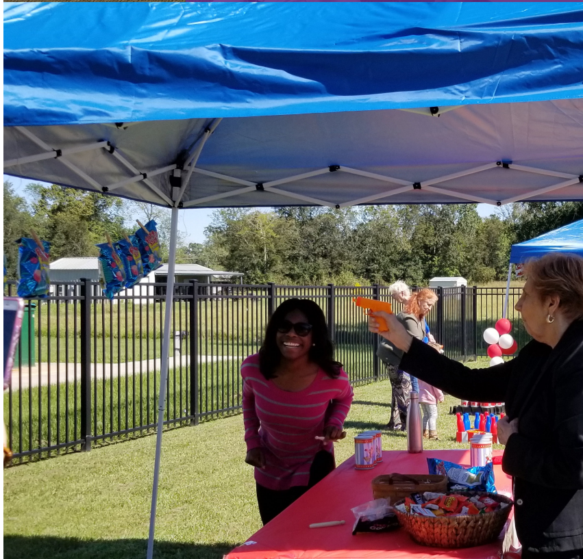
Country Fair at Charlie's Place/Gonzales