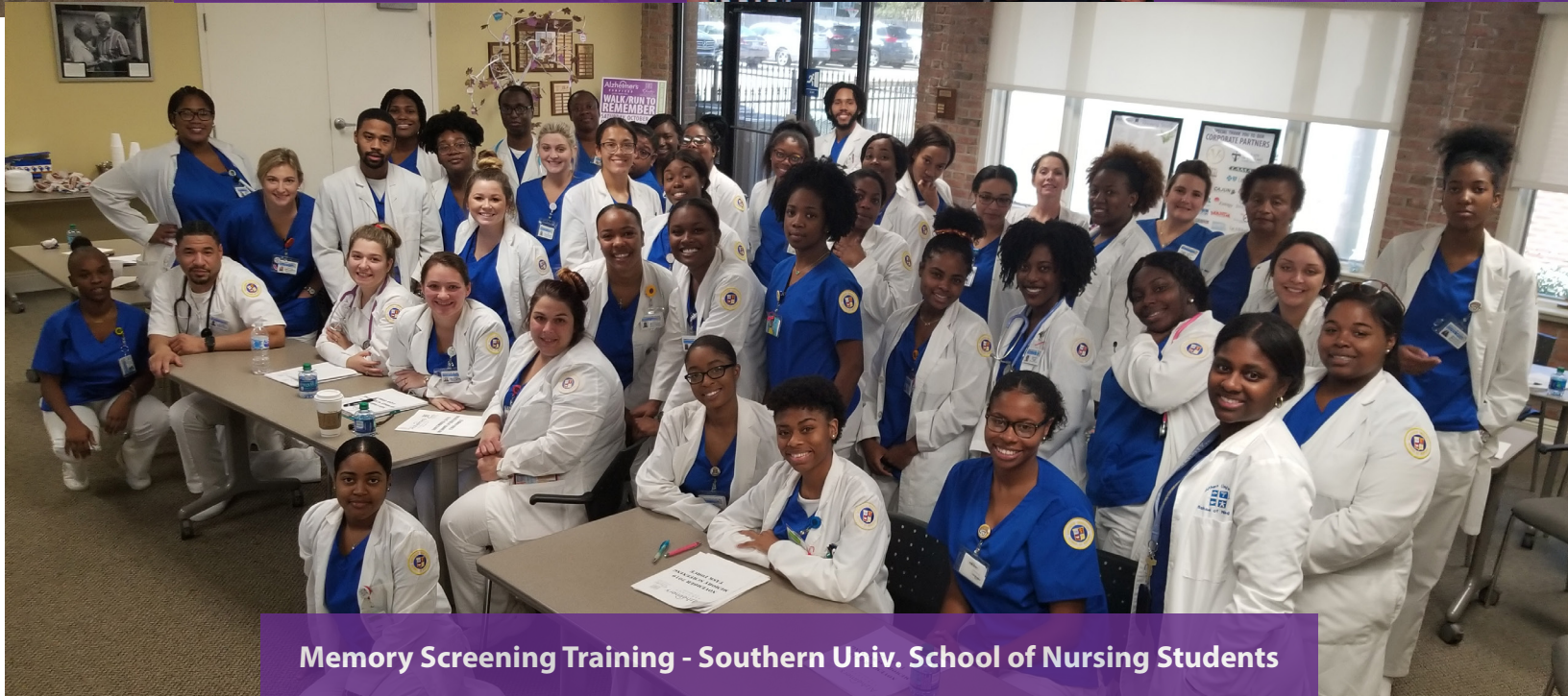
Memory Screening Training - Southern Univ. School of Nursing Students