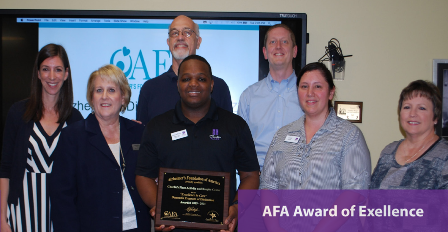
AFA Award of Excellence