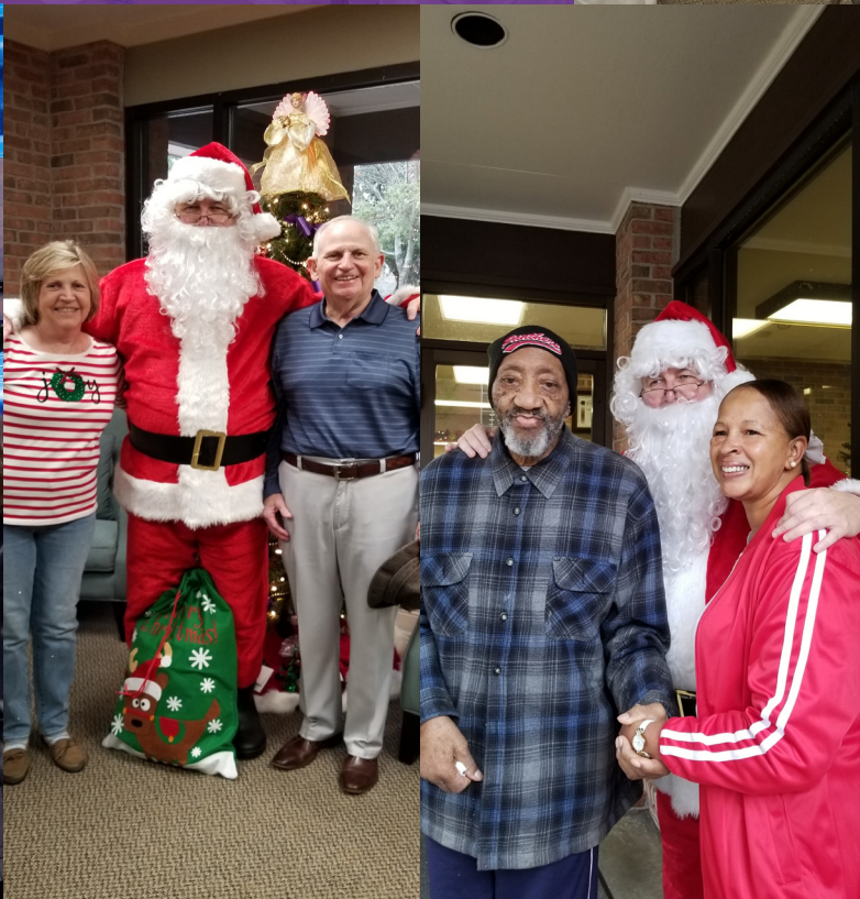
Christmas TLC: Holly Jolly Jamboree