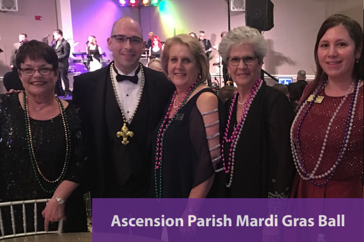
Ascension Parish Mardi Gras Ball