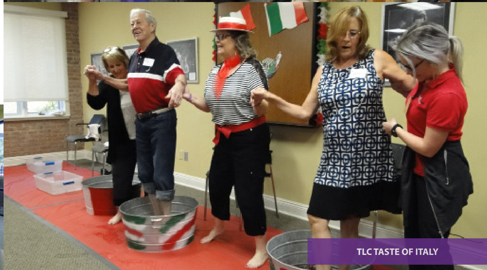
TLC TASTE OF ITALY