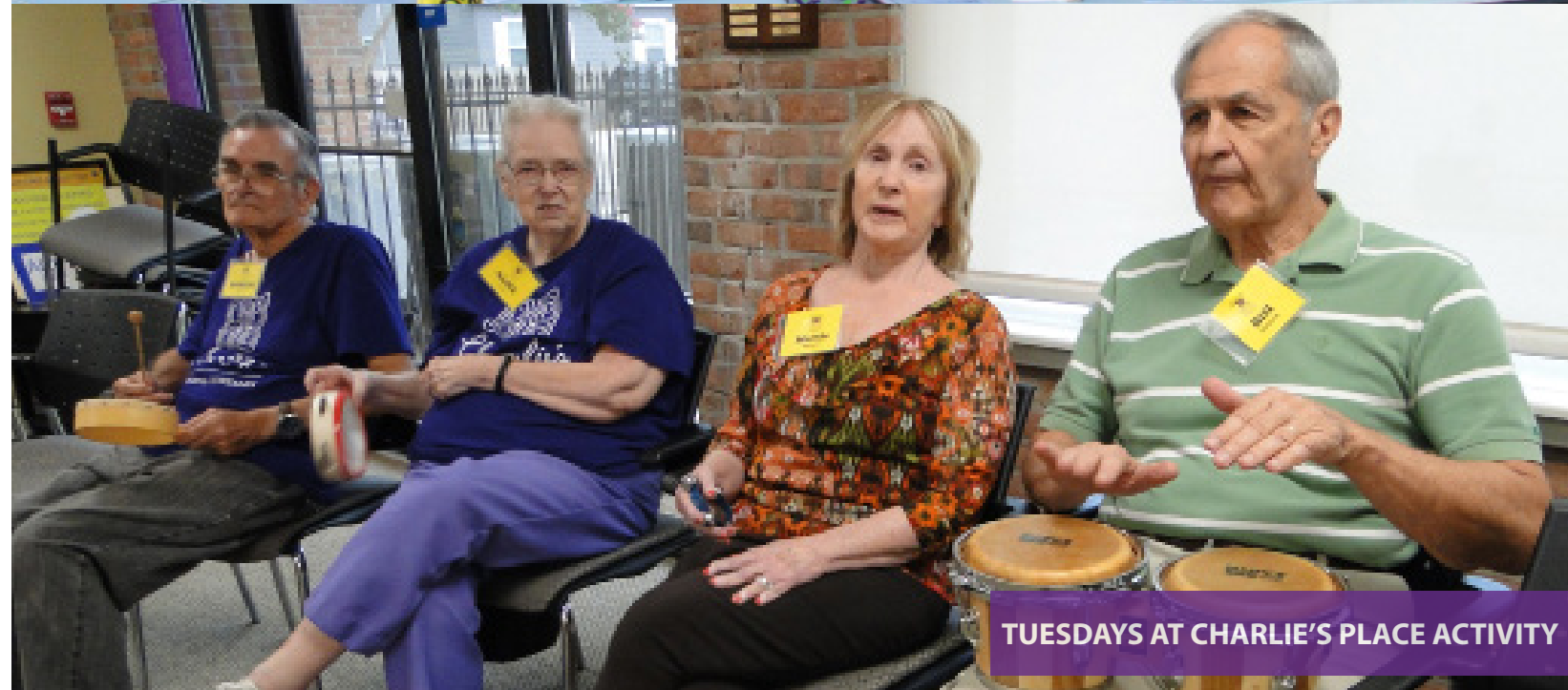
TUESDAYS AT CHARLIE'S PLACE ACTIVITY