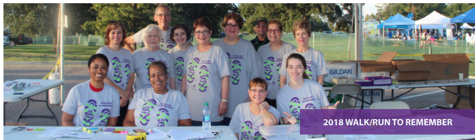
2018 WALK/RUN TO REMEMBER