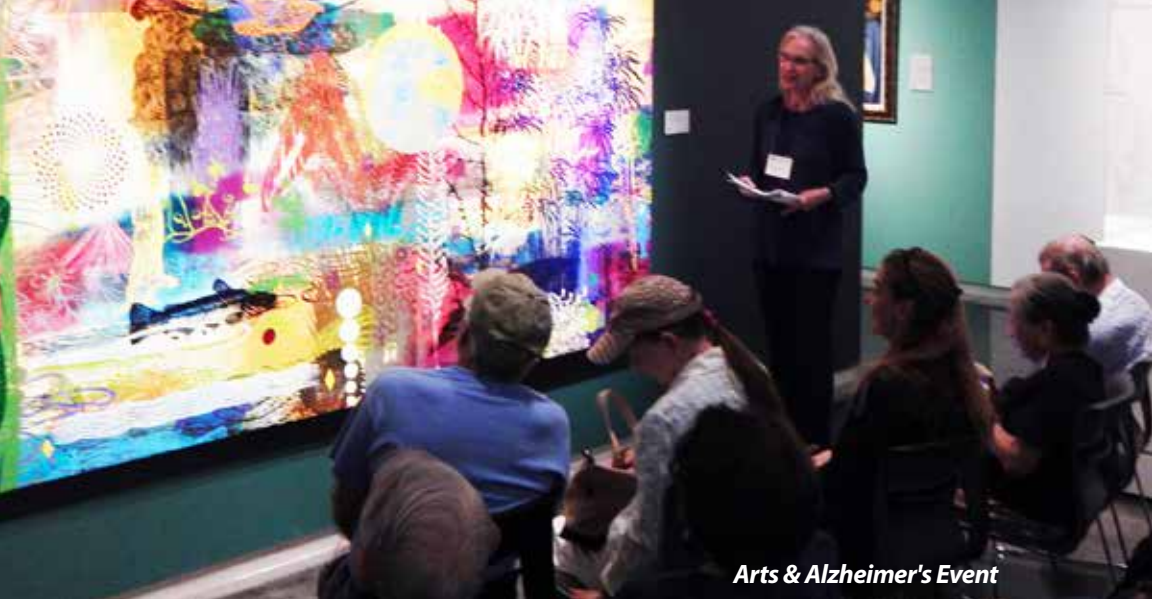
Arts & Alzheimer's Event