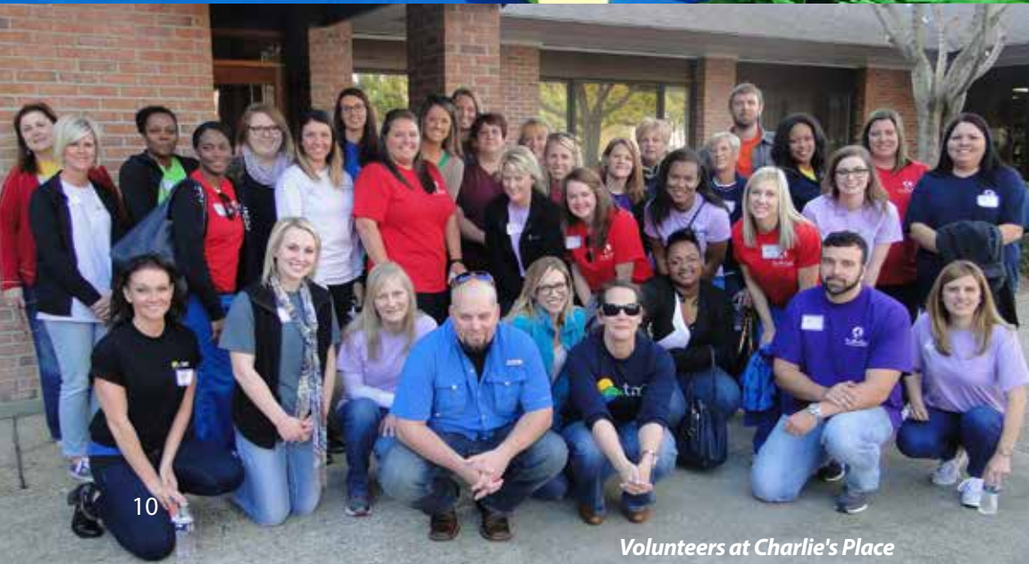
Volunteers at Charlie's Place