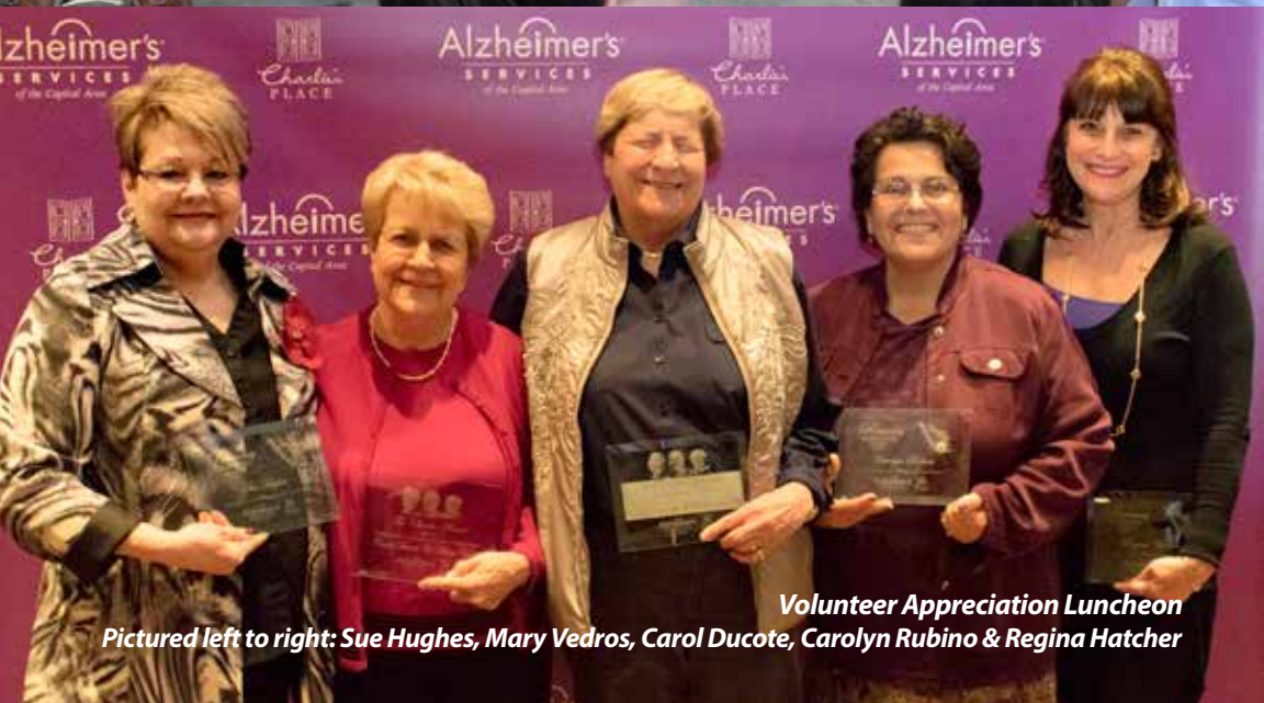
Volunteer Appreciation Luncheon