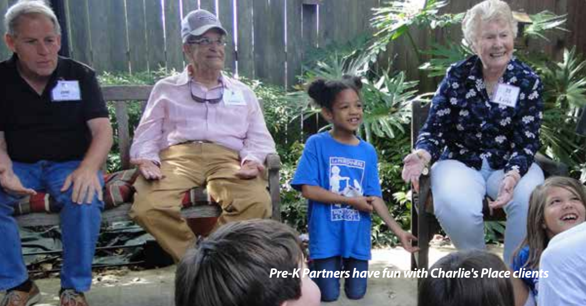
Pre-K Partners have fun with Charlie's Place clients