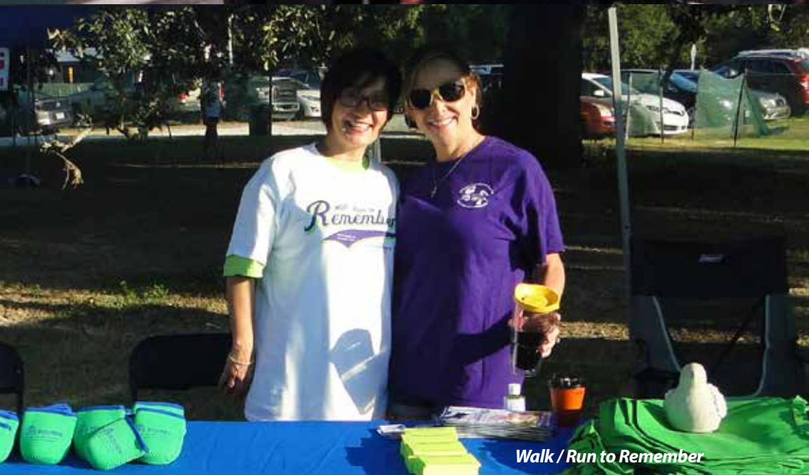
Walk / Run to Remember