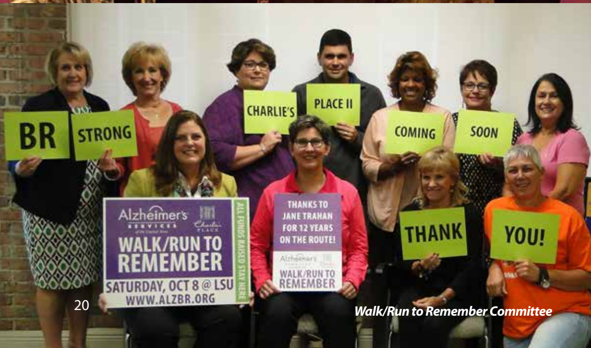
Walk/Run to Remember Committee