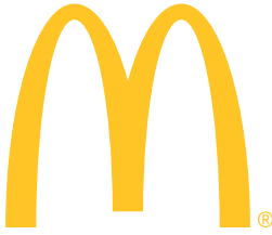
Valluzzo Family Restaurants